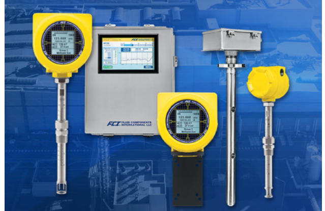
Figure 3: FCI Model ST100, ST102 and MT100 flow meters

These applications are often difficult for other flow meter technologies because of distorted flow profiles associated with inadequate straight-run and larger cross-sectional measurement areas, which can lead to inaccurate flow readings when using a single point meter design. The use of multiple sensors addresses this by breaking a large cross-section down into smaller measurement areas and averaging them to provide a more accurate reading.