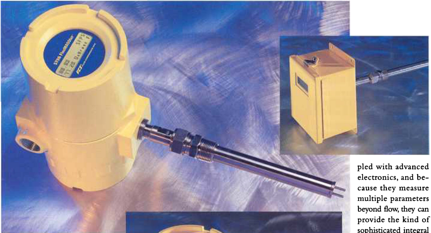
Mass flowmeters offer great accuracy and repeatability.

not only measure mass flow, but can also measure volumetric flow, density, temperature and fraction-flow. They offer exceptional accuracy to 0.1% of actual flow and repeatability to 0.05%. Unaffected by variations in pressure, temperature, density, electrical conductivity and viscosity, they are non-intrusive and measure down to the tiniest droplets to detect extremely