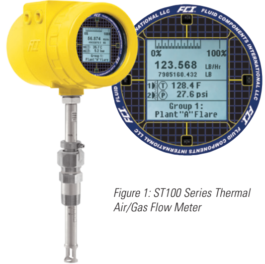
Figure 1: ST100 Series Thermal Air/Gas Flow Meter

For example, the ST100 Series thermal flow meter (Figure 1) from Fluid Components International (FCI) consists of an easy to install insertion flow element with a rugged and powerful electronics/transmitter. With specific calibrations for mixed gas compositions, if needed, the split-range/dual calibration feature with (3) 4-20 mA analog outputs or digital bus communications (HART, FOUNDATION™ Fieldbus, PROFIBUS or Modbus) make it ideal for flare applications.