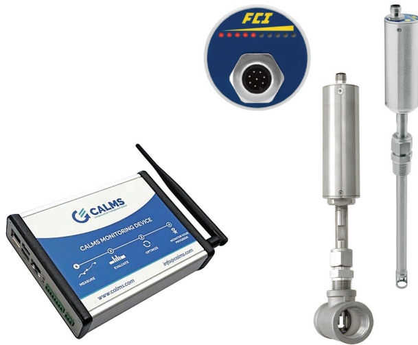
CAL-EDGE device for audits and monitoring (P/O)