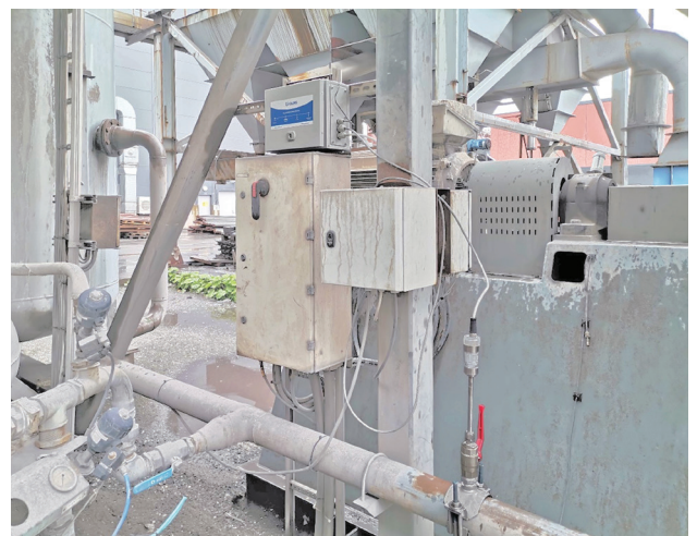
Installed CAL-PM device and FS10i with hot tap installation

These compressed air measurement advantages include: thermal dispersion direct mass flow measurement requiring no additional pressure or temperature sensors, easy hot-tap insertion installation for temporary or permanent service, no moving parts for safety and a sealed design with no orifices to clog or foul.