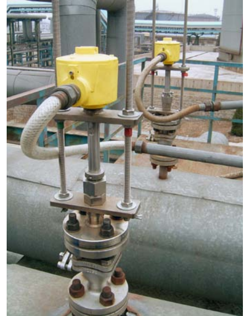
Figure 4: ST110 Flow Meter with packing gland

Until now, validating the calibration of a gas flow meter has been extremely expensive because it meant either installing a second reference flow meter in the pipe line or removing the meter from the pipeline altogether and returning it to the manufacturer. The latter option could also mean purchasing a spare meter to use while the first unit was offsite as well as paying the costs of the additional testing and shipping.