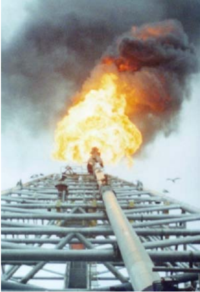
Figure 1: Typical offshore flare stack

Flare gas is the name given to the surplus waste gas produced during the extraction of crude oil and the subsequent refining process. It is typically vented to atmosphere and burned in a flare stack (Figure 1). The process inevitably releases large quantities of carbon dioxide (CO 2 ) to the atmosphere, which is a major contributor to global warming.