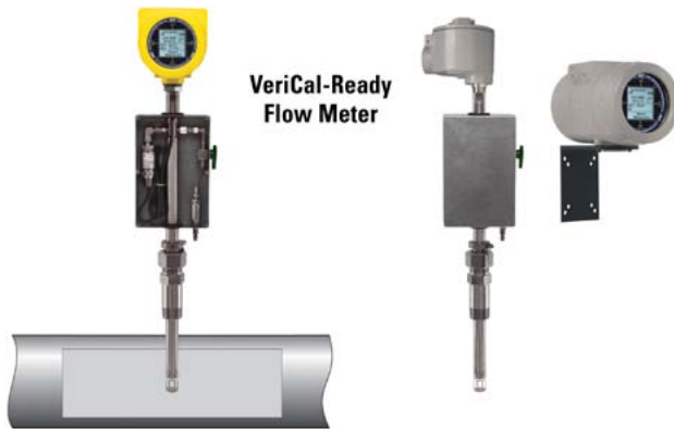
Figure 2: FCI ST110 Flow Meter

conventional differential pressure (DP) measurement across an orifice plate operates over 5:1 turndown, an ultrasonic flow meter withstands a 40:1 turndown.