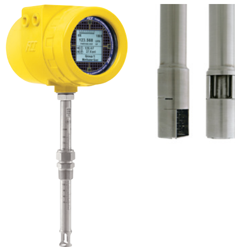
Figure 4: ST80 flow meter; Wet Gas MASter flow sensor

totalized flow, alarms, diagnostics feedback and a user defined label field is also available. Technicians can easily spot check flow data in person for reliability.