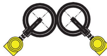
Angled at 45° from Horizontal

Option 1. Install a standard thermal flow meter using constant power (CP) technology and optimize the installation itself to minimize or prevent condensation from contacting the sensor.