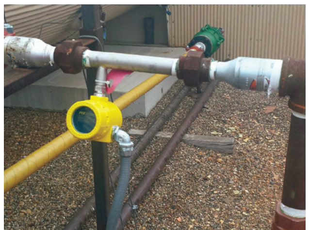
Figure 3: FCI Model ST75V flow meter installed at well head

The ST75V meter's transmitter outputs include dual 4-20 mA analog outputs, which are user assignable to flow rate and/or temperature, a 0-500 Hz pulse output for totalized flow and a serial RS-232C I/O port. The optional digital display/readout is a two-line LCD displaying flow rate and totalized flow or flow rate and temperature. In applications with difficult access or display readability, the ST75V's transmitter is also available to be remote mounted up to 50 feet (15 m) away from the flow element inserted in the pipe.