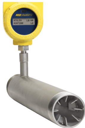
Figure 2: FCI Model ST75V flow meter

This meter's flow element is constructed with a 316L stainless steel body and its Hastelloy C-22 thermowell sensors resist corrosion. Real-time temperature compensation is standard across the whole operating temperature range for accurate, repeatable measurement year-round.