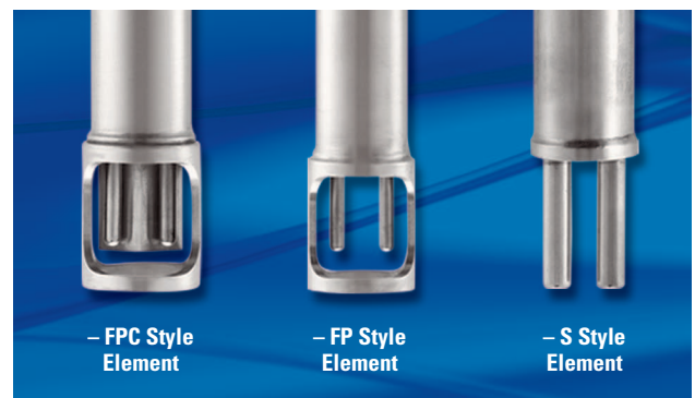
Figure 3: Multiple Sensor Heads

The ST100 Series is comprised of two core model families: the ST and STP. The ST family measures both mass flow and temperature, and the exclusive STP family adds a third parameter—pressure. The STP configuration makes the ST100 the world’s first triple-variable thermal flow meter, measuring flow, temperature and pressure. Both families include single-point and dual-element models as configurations outfitted with FCI’s exclusive in-situ calibration option, VeriCal.