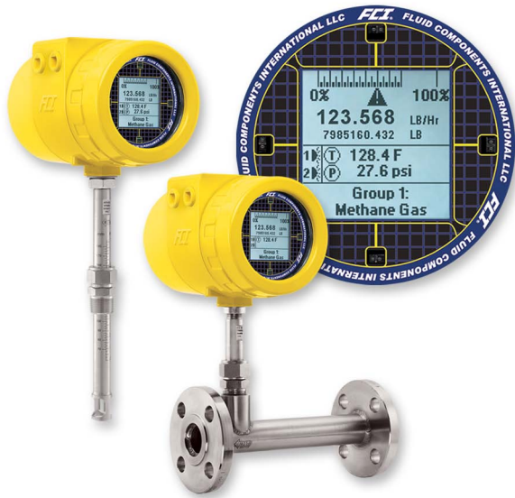
Figure 1: FCI ST100 Series Thermal Mass Air/Gas Flow Meter