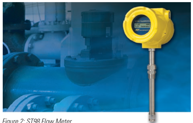
Figure 2: ST98 Flow Meter

A thermal mass flow meter, such as FCI's Model ST98 (Figure 2) employs a no-moving parts design flow sensor inserted