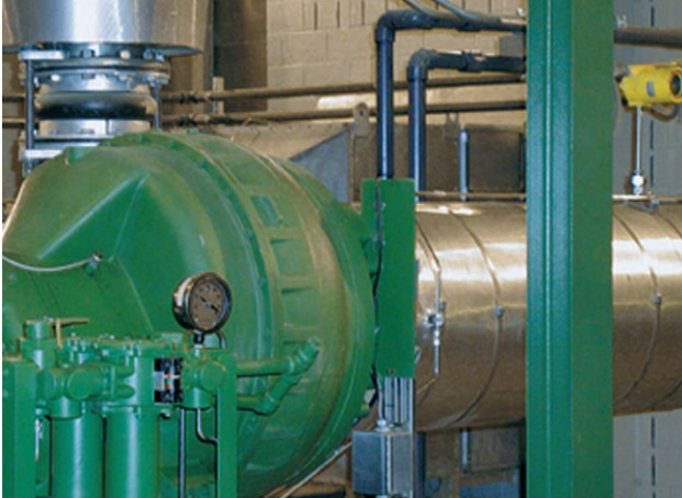
Figure 1: Ozone Treatment System

By Stephen Cox, Sr. Member Technical Staff Fluid Components International