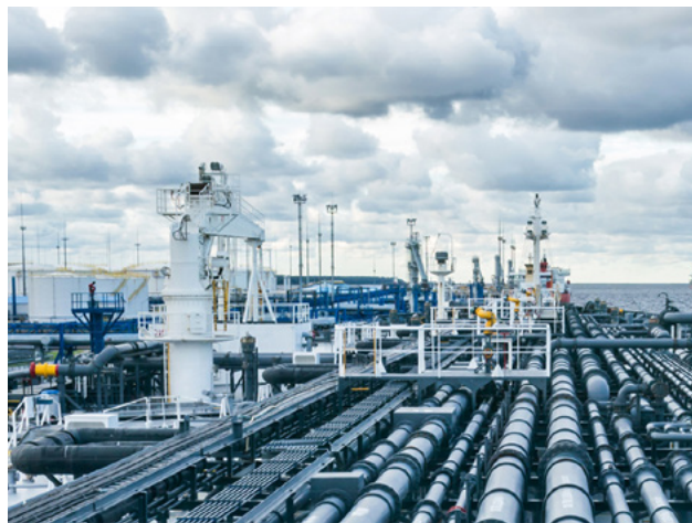
Figure 1: Oil product tanker loading from shore terminal

Large loading arms ( Figure 1 ) connect shore installations to vessels delivering or transporting petrochemical products that include crude oil, diesel, petrol, bitumen products and many different types of specialized chemicals. These loading arms are highly engineered pieces of equipment that in marine environments must adjust themselves to the constant motion of tankers responding to windy weather and the ocean tide patterns.