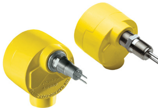
Figure 2: FCI FLT93F and FLT93S flow switch

An electronic control circuit converts the RTD temperature difference into a conditioned DC voltage signal. These signals are used to drive adjustable set point alarm circuits and outputs. Depending on the switch configuration, alarms are field